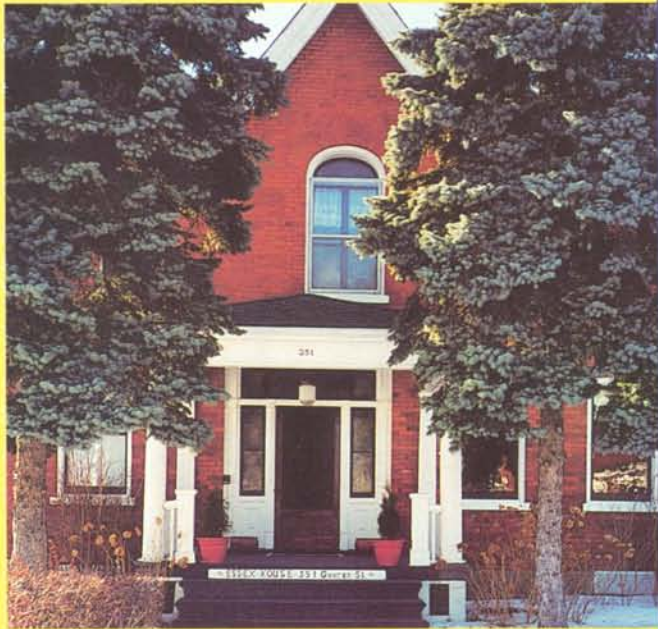
351 George Street, Cobourg Ontario K9A 3M2