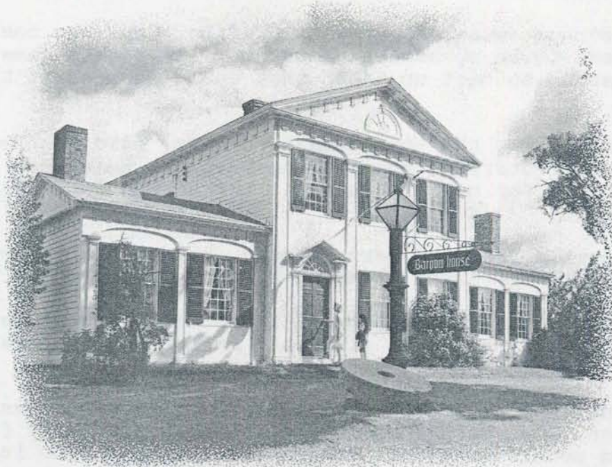
"BARNUM HOUSE & GRAFTON, 1815"