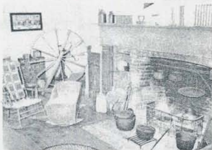
Kitchen Of Barnum House