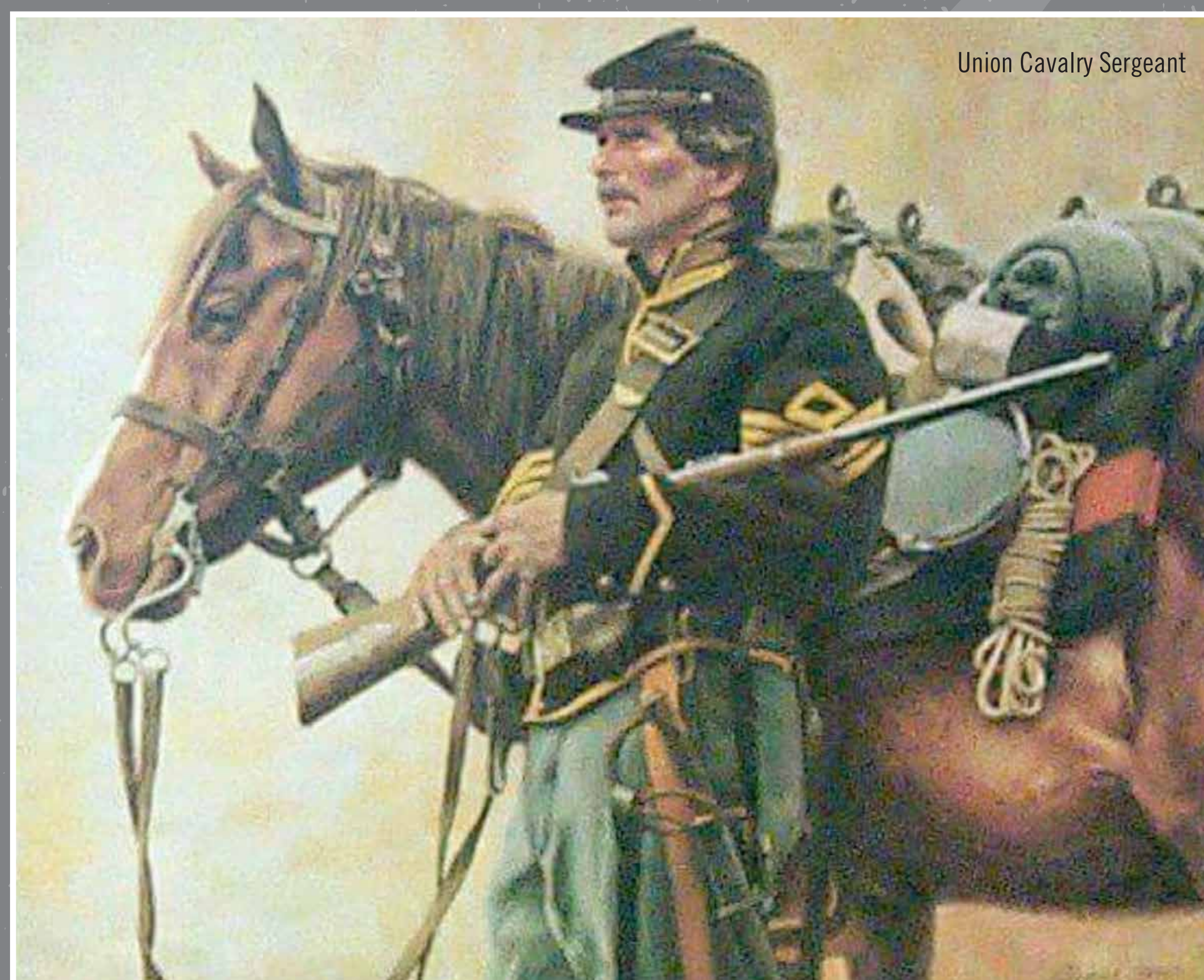
Union Cavalry Sergeant