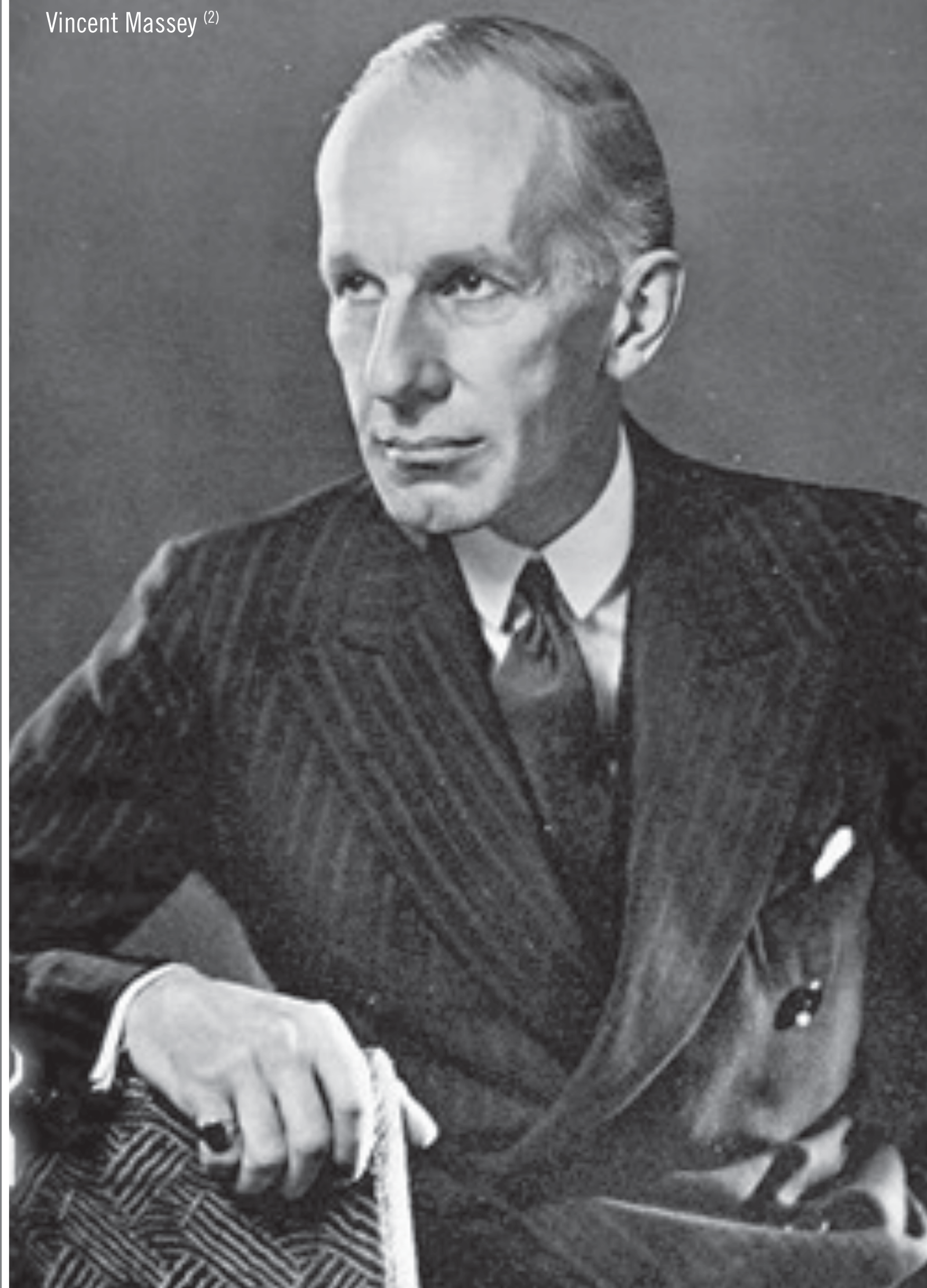
Vincent Massey (2)

Vincent Massey (1887-1967) is remembered chiefly as the first Canadian-born Governor General of Canada, but he had many other accomplishments. He and his wife Alice were “inseparable, each an essential support to the other” from their marriage in 1915 until her death in 1950. They made a significant contribution to the life of Canada through their years of public service and philanthropy.