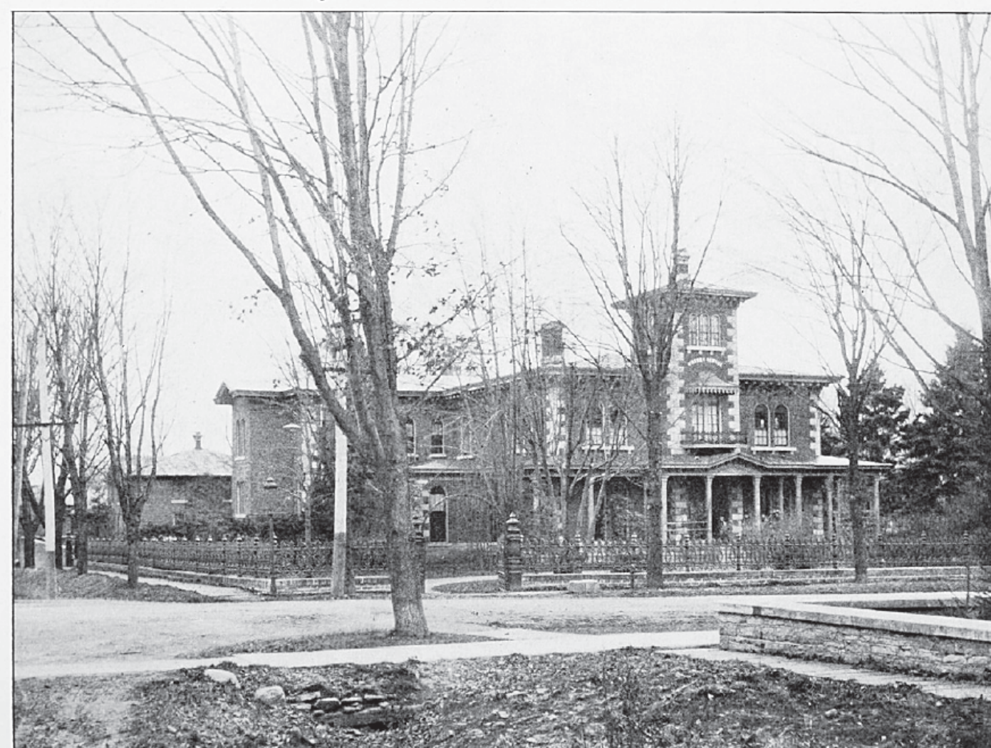
WINTER VIEW FROM THE NORTH