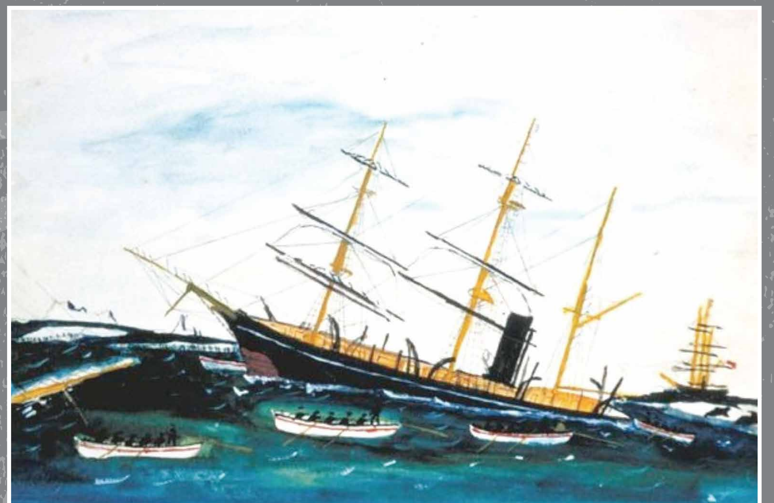
Jan Mayen