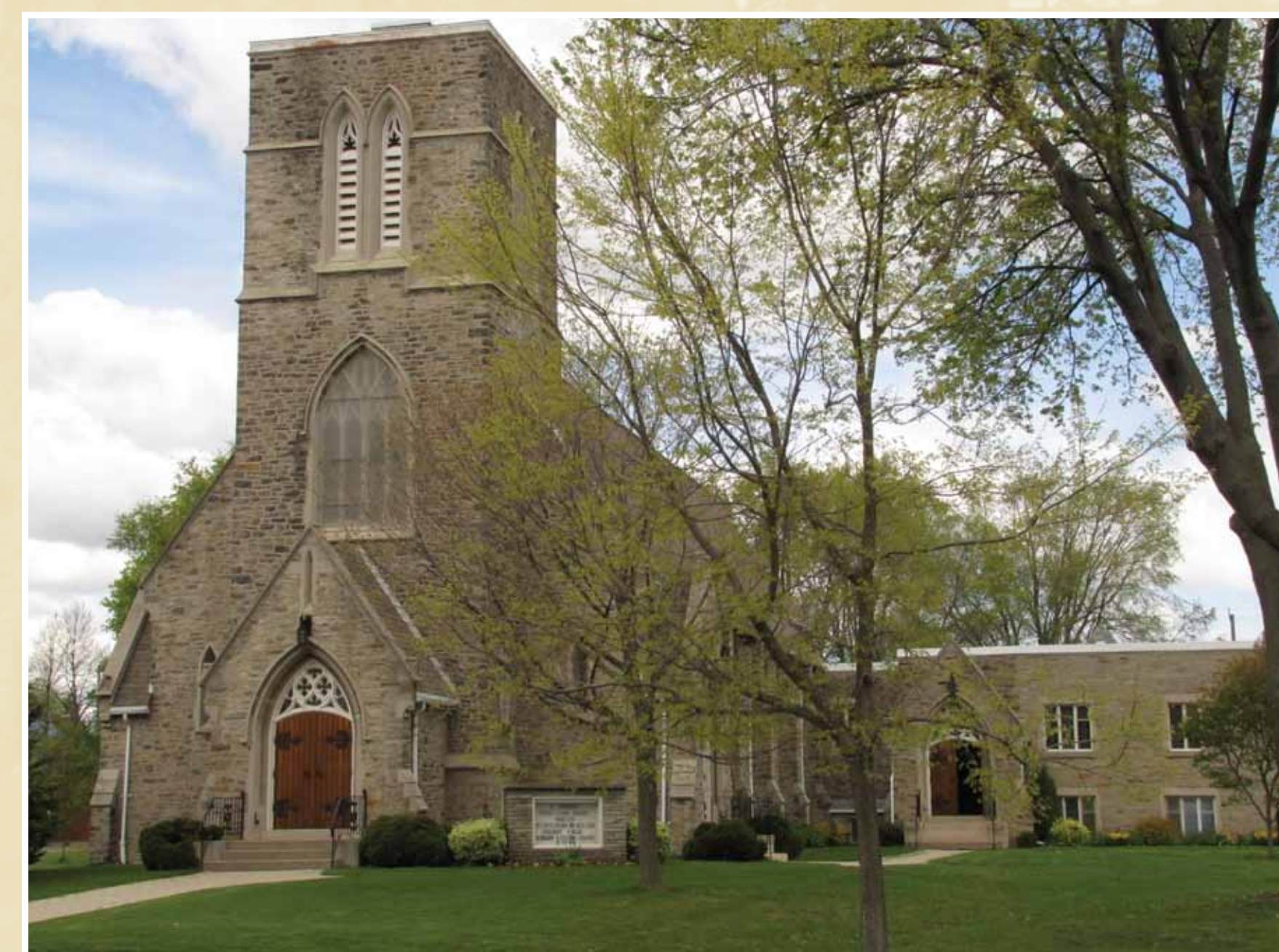
St. Andrews today.