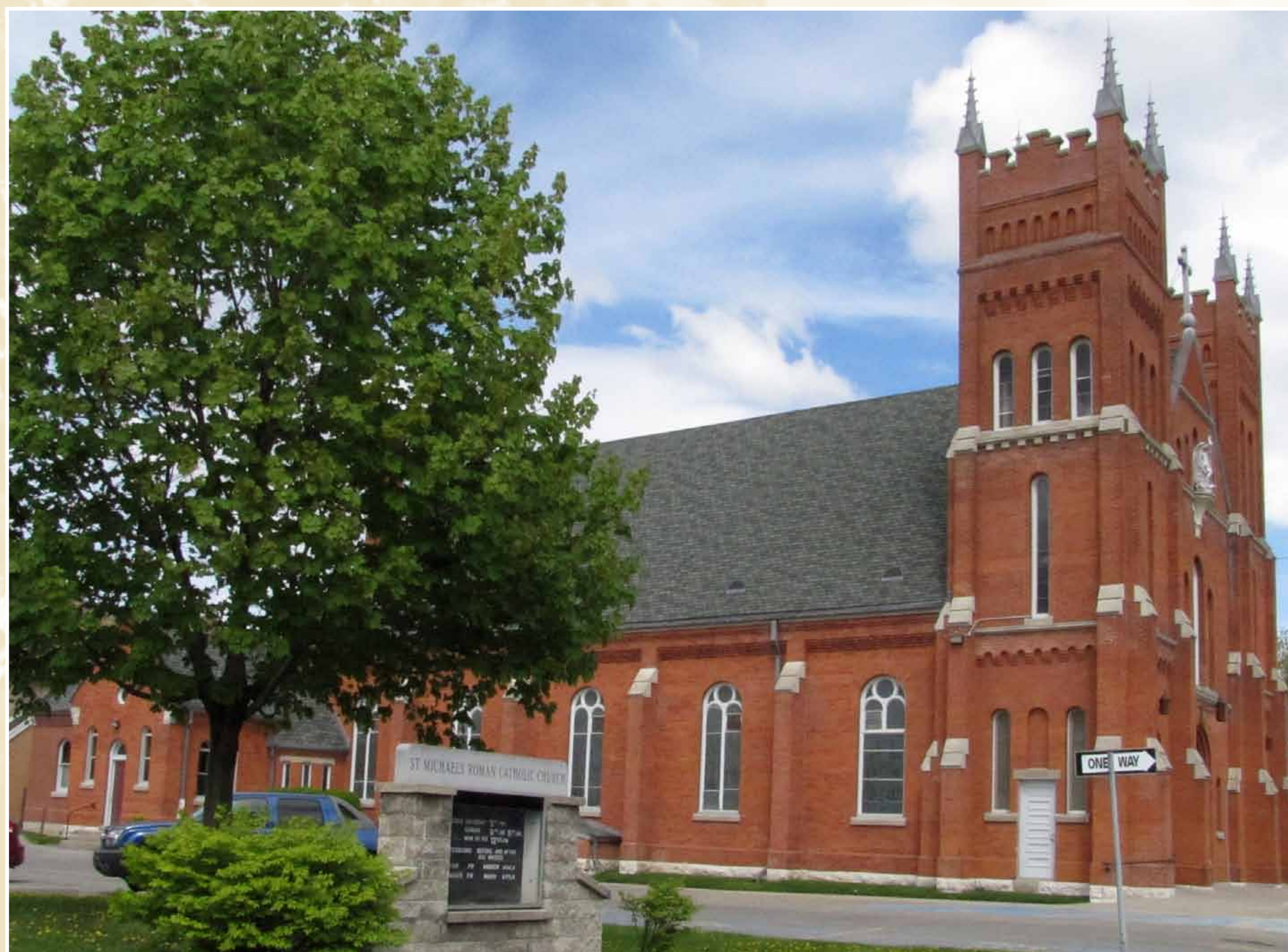
St. Michael's today