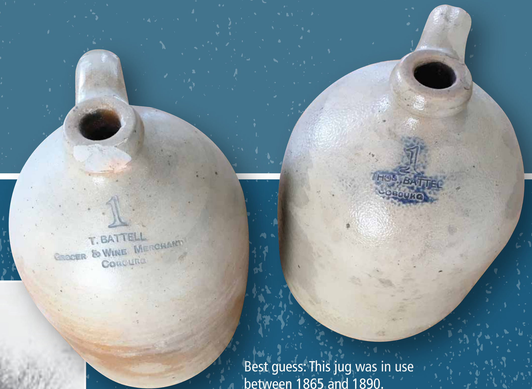
Best guess: This jug was in use between 1865 and 1890.

1865 Gazeteer - groceries and provisions on King Street