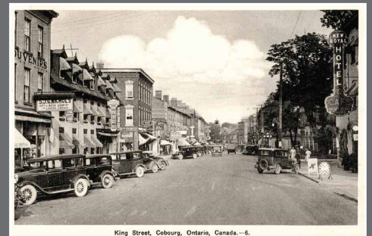
King Street, Cobourg, Ontario, Canada.—6.