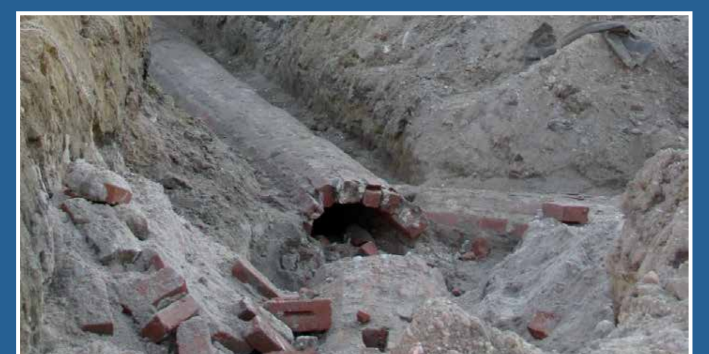
Sewer – 1830s Brewery Excavation 2017