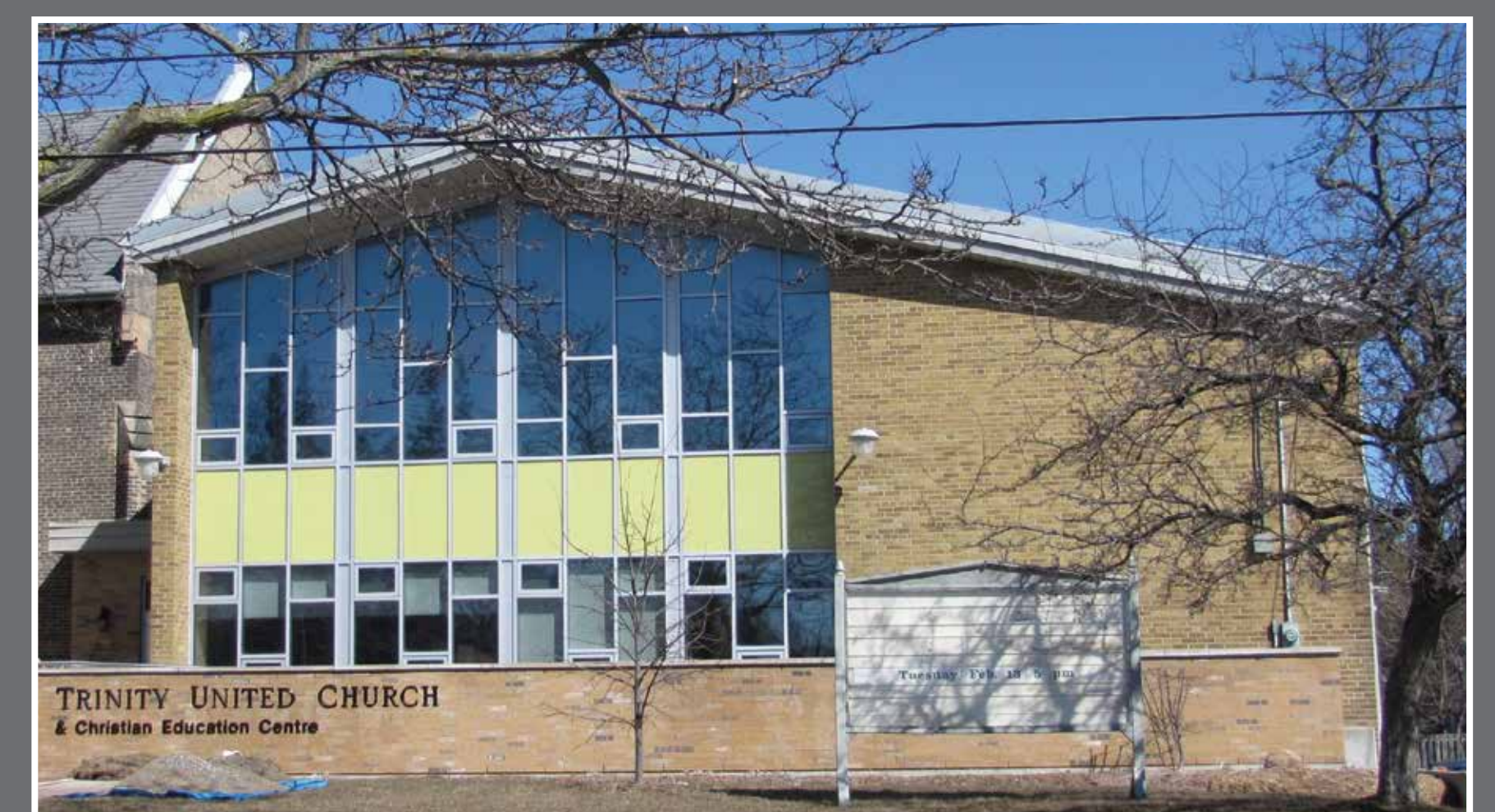
Trinity Education Centre