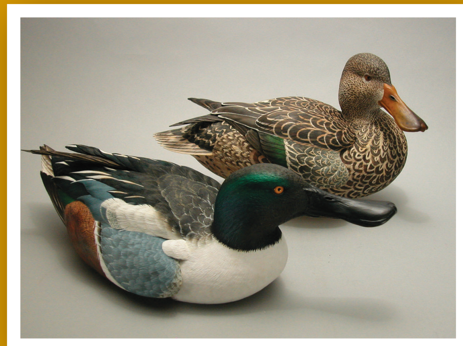
Northern Shoveler Hen and Drake