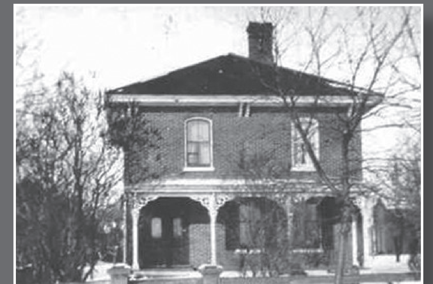
Guillet Home on James St.