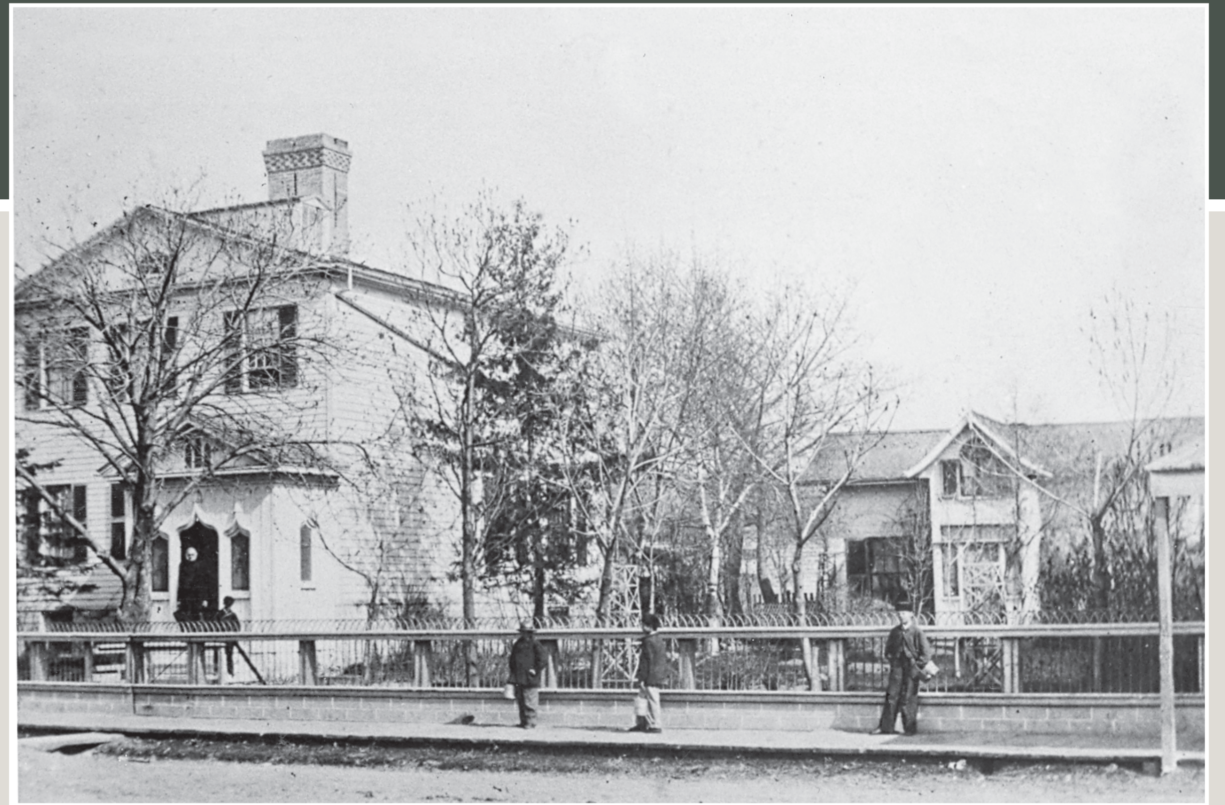
"The Chestnuts" 134 King St. West