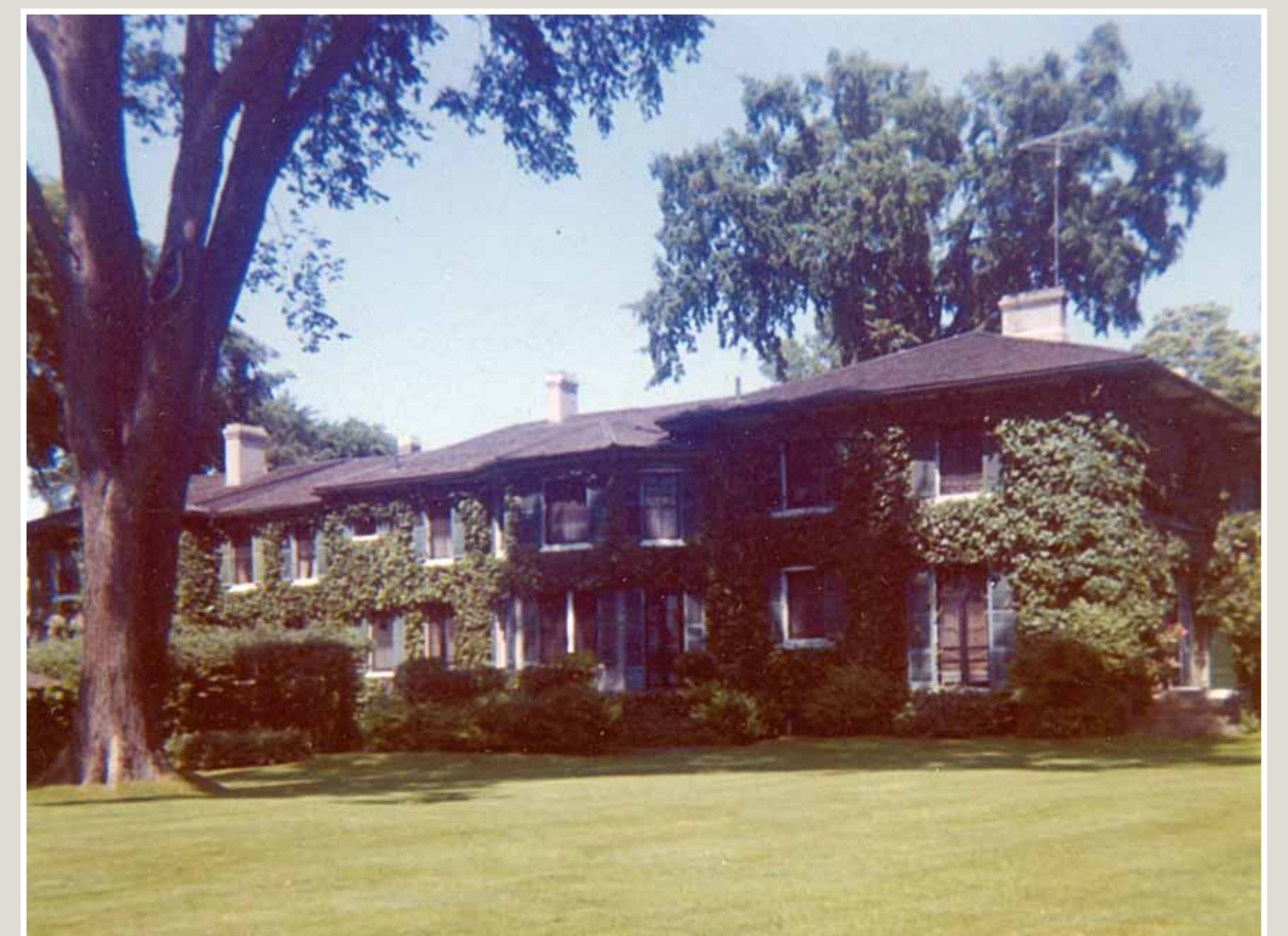
The Boulton Villa known as "The Lawn"