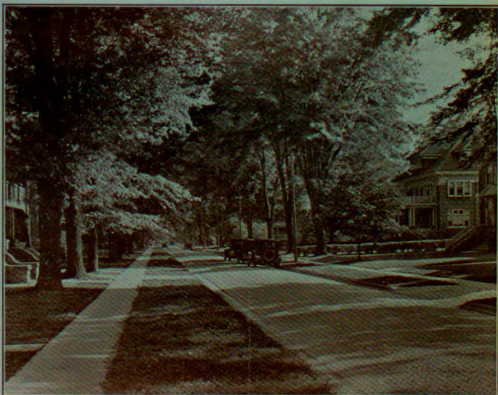
WELLINGTON STREET WEST