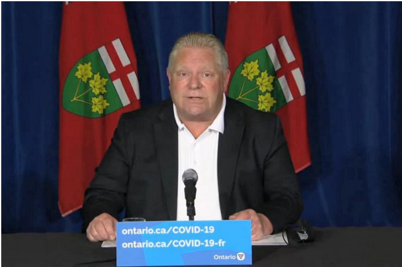
At a media conference at Queen's Park on May 28, 2021, Ontario premier Doug Ford announced the province is accelerating administration of second doses of COVID-19 vaccine during the summer.

The Ontario government also confirmed the provincial declaration of emergency and stay-at-home order will expire on Wednesday, June 2nd. The province's "emergency brake" will remain in effect, with public health measures and restrictions still in place, until the province is ready to enter step one of its reopening plan, expected to begin Monday, June 14th.