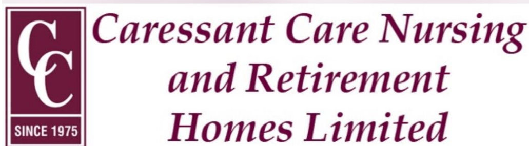
Caressant Care Logo

KAWARTHA LAKES-Officials at Caressant Care on McLaughlin Road in Lindsay are investigating whether the ventilation system in the building could be fuelling the spread of Coronavirus.