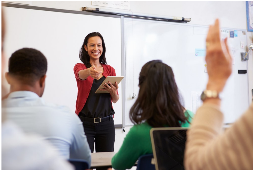
photo credit: pennstatenews Abington career expo via photopin (license)

KAWARTHA LAKES-The Council of the Ontario College of Teachers endorsed the creation of a Temporary Certificate to enable faculty of education students to begin teaching earlier as a partial solution to Ontario's teaching shortage.