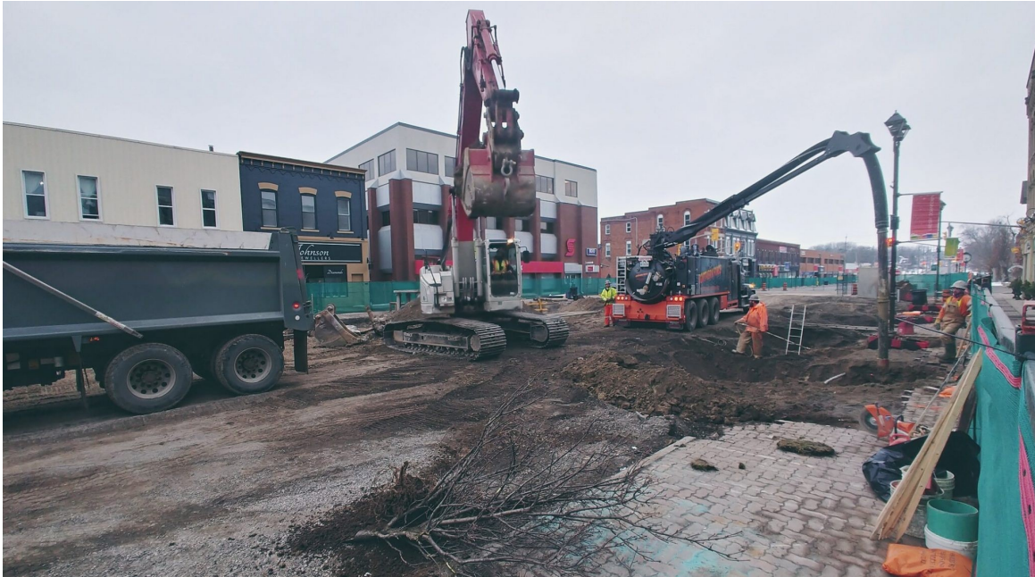
The first section of Kent Street, from William Street to Cambridge Street, has now begun.