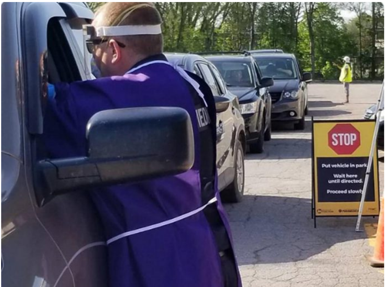
The drive-through COVID-19 testing clinic at Kinsmen Civic Centre in Peterborough for residents