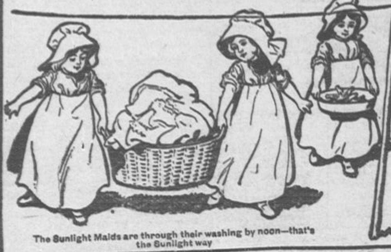
The Sunlight Maids are through their washing by noon—that's the Sunlight way