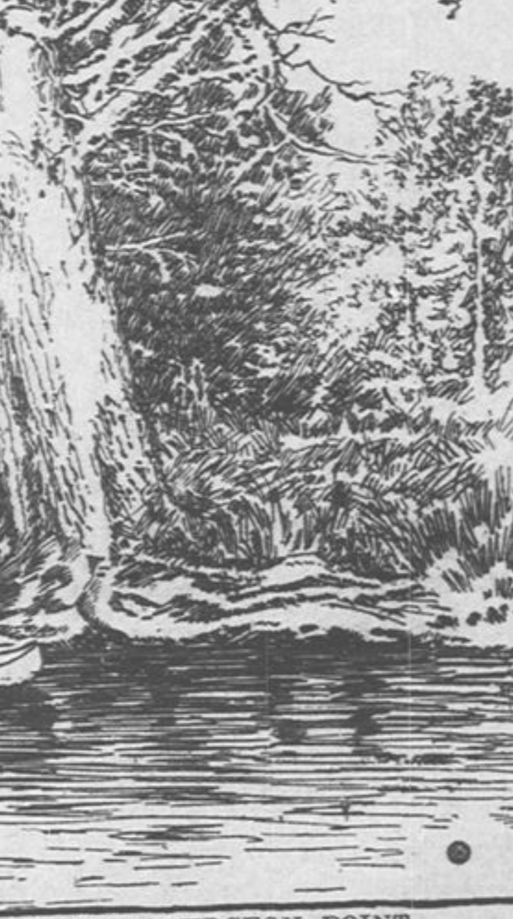
CHARMING BIT OF SHORE LINE, STURGEON POINT.

In connection with the 'feeding of the multitude', the officers of the Association have it in their power to effect an improvement next season that will be hugely appreciated by