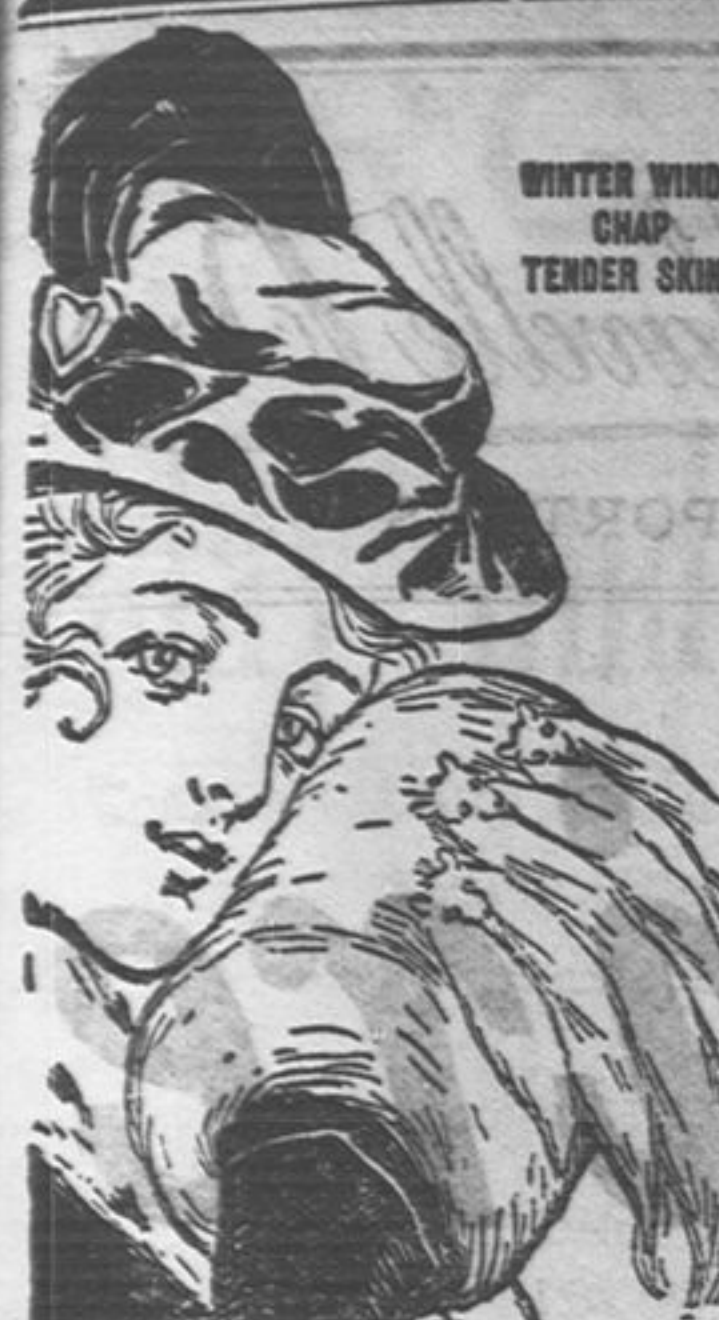
Preserve, Purify, and Beautify the Skin, Scalp, Hair, Hands, with Cuticura Soap.