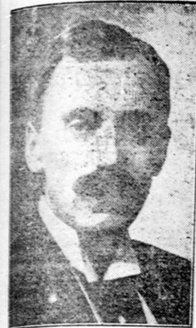
N. W. ROWELL, K.C. The new Liberal leader in Ontario, succeeding Hon. A. G. MacKay.