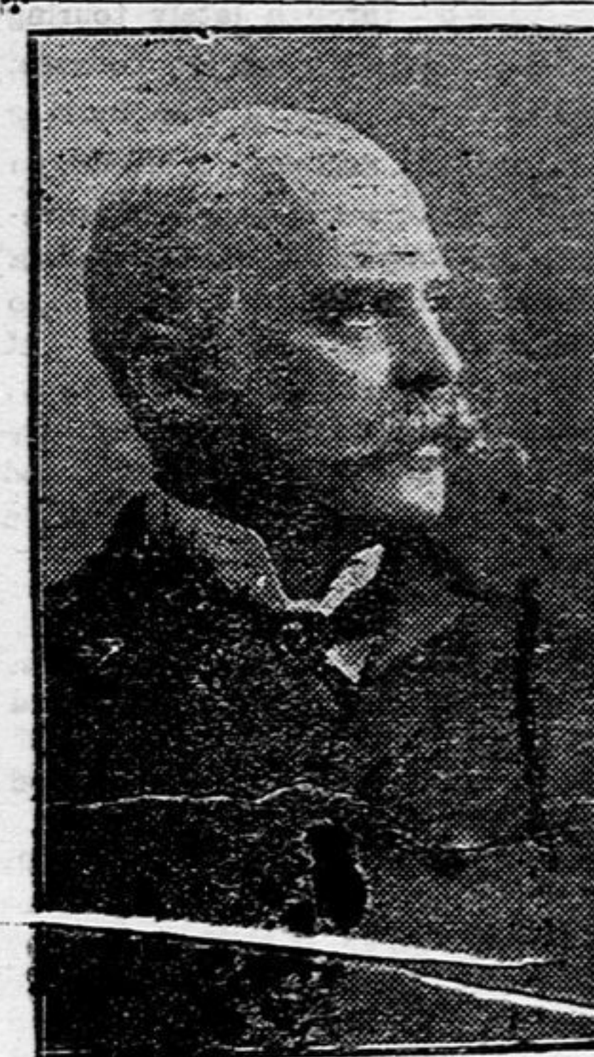
MAYOR GUERIN. Montreal's Chief Magistrate, who will figure prominently in Eucharistic Congress.

Rice croquettes are sometimes fried in the chafing dish with butter.