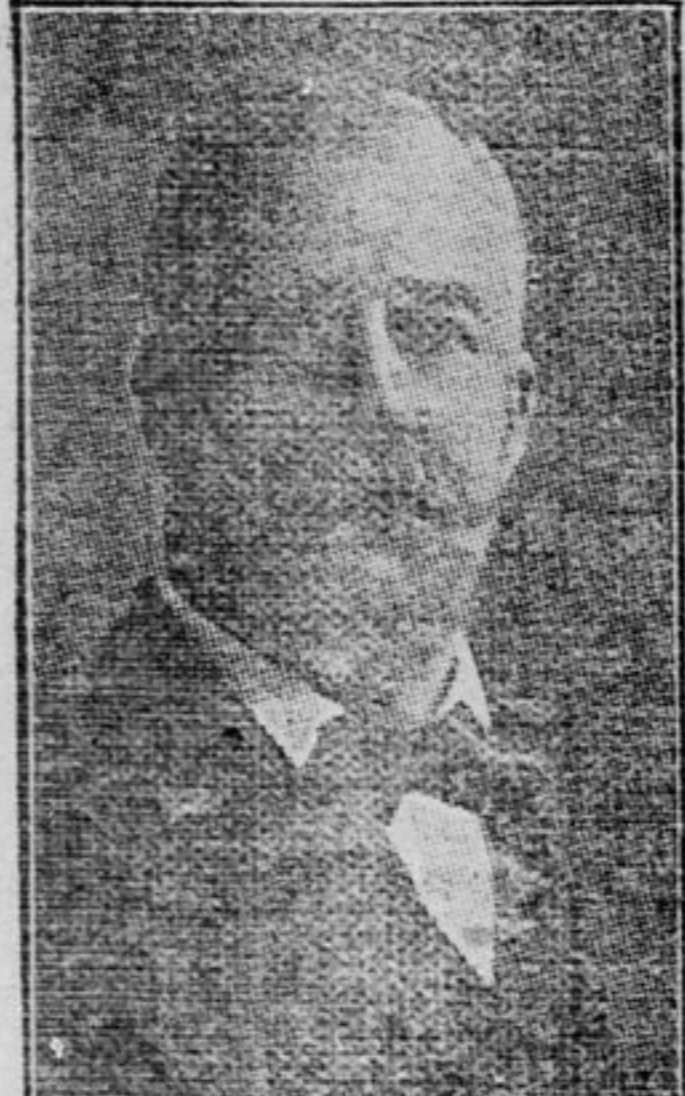
SIR RODMOND ROBLIN, Manitoba's Premier got severe job on Friday

WINNIPEG, July 11.—Reports received thus far have not definitely determined the standing of the parties in the next Legislature, but they indicate clearly enough that the Government will have a small majority, may be increased to a working efficiency in the three bye-elections yet to be held in the deferred northern seats. The Liberals claim a tie of 21 seats with the Conservatives, but with four seats to hear from. These are claimed by the Government, but also claim several of the seats which the Opposition in their own behalf. A detached estimate might put the final standing at 25 Conservatives and 21 Liberals, with three seats in dispute.