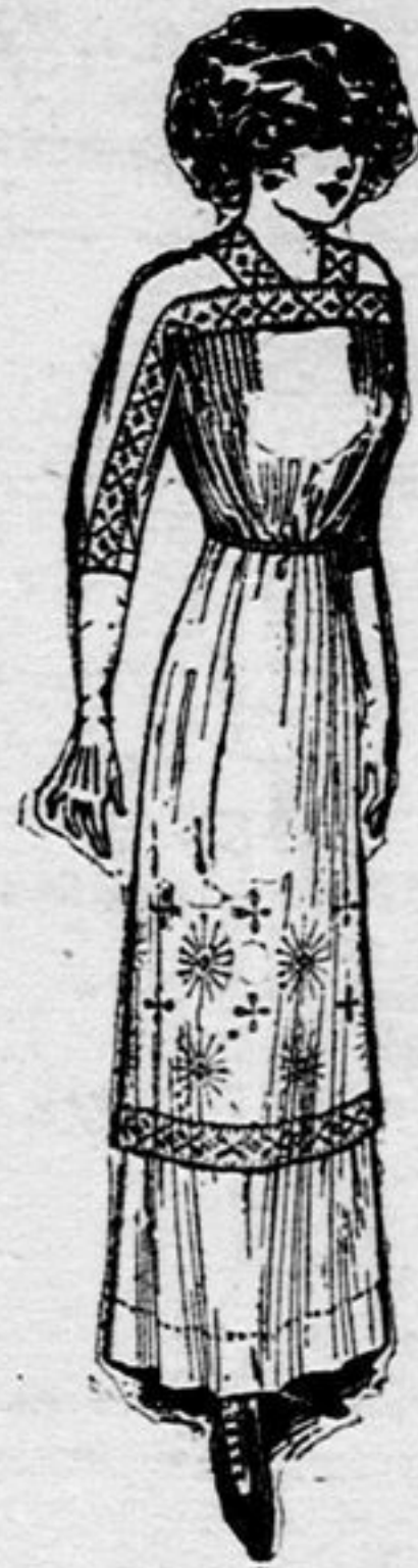
McCall Pattern No. 4025 Price, 15 cents A PRETTY LITTLE FROCK

We have a most Complete Stock of Ladies', Misses' and Children's Wash Dresses made in the very Newest American Styles.