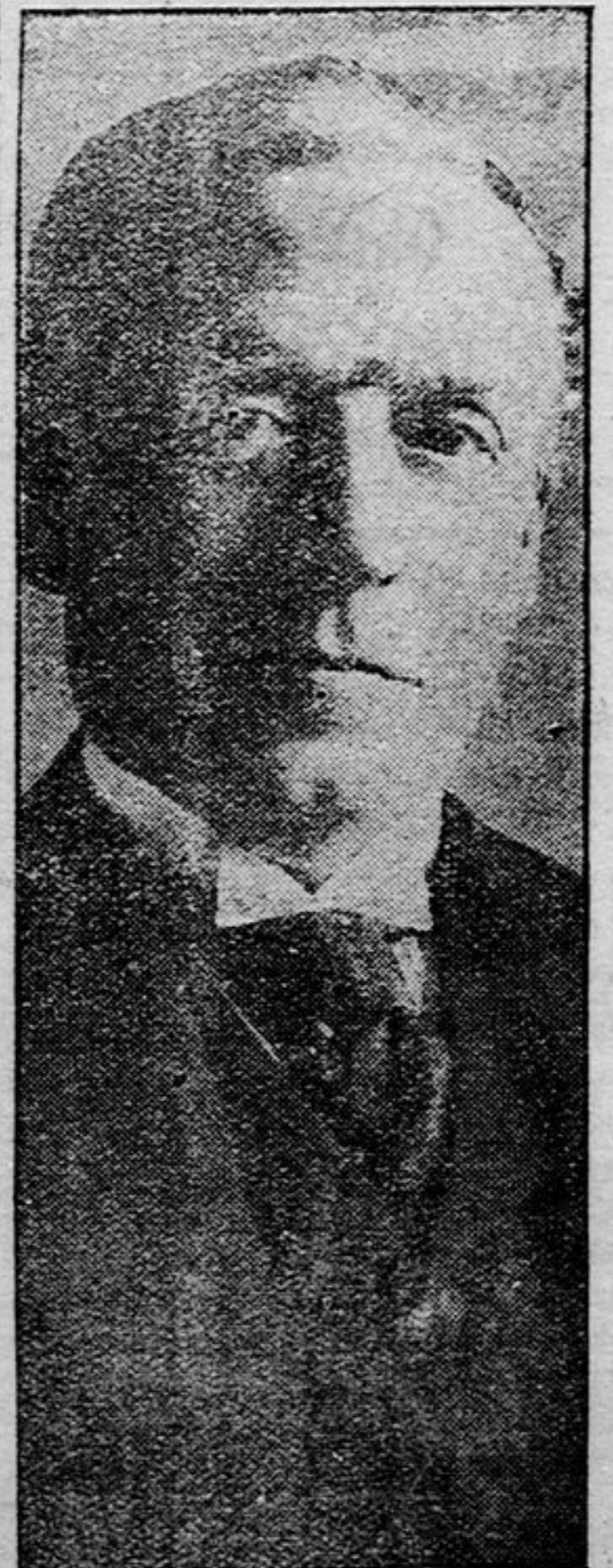
RT. HON. H. H. ASQUITH