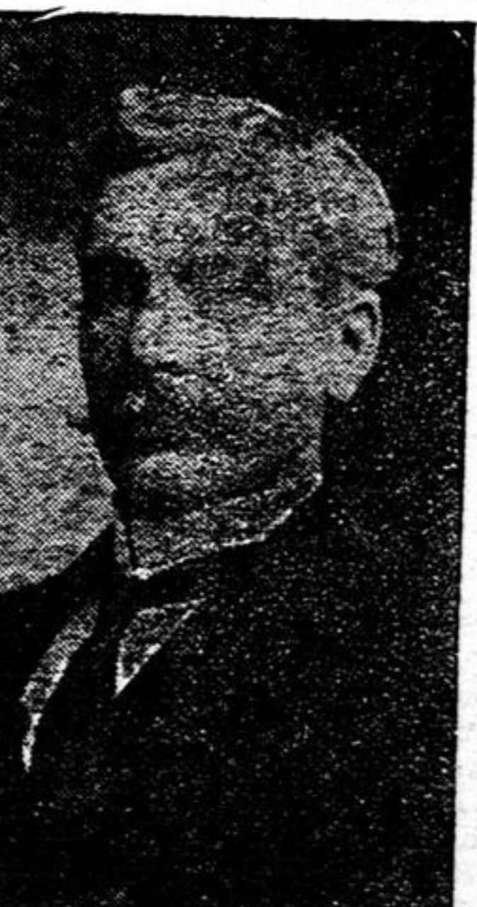
HON. G. P. GRAHAM, Minister of Railways and Canals.