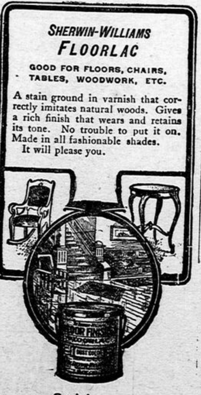
Get it from us.