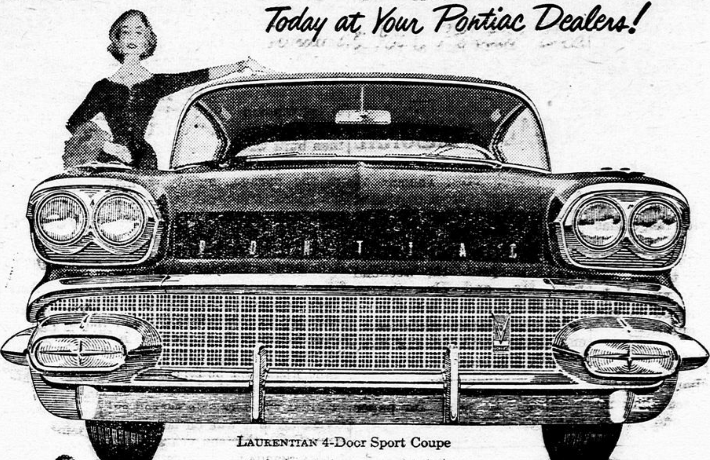
LAURENTIAN 4-Door Sport Coupe