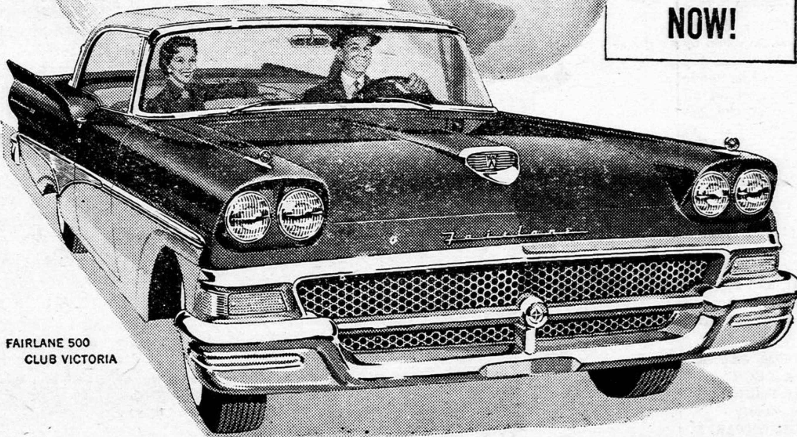
FAIRLANE 500 CLUB VICTORIA

• See the NEW STYLING that created an international sensation—lines that flow, sleek and low, in cars to capture your imagination. • Drive Ford's ALL-NEW INTERCEPTOR V-8's with Precision Fuel Induction—they set new standards of V-8 performance. • Ford introduces NEW CRUISE-O-MATIC DRIVE , greatest advance yet in automatic driving—it's part of a whole new "power-train" that, coupled with the new V-8 engines and a low rear axle ratio, gives you built-in overdrive ECONOMY—UP TO 15% MORE GAS MILEAGE! • Try Ford's NEW AIR SUSPENSION, FORD-AIRE —it's like riding on the wind! • You discover Ford's NEW MAGIC-CIRCLE STEERING makes steering as easy as pointing—guides you smoothly through city traffic, gives superb control on super-highways. • See all the NEW AND EXCITING ADVANCES in Ford for '58. The features of the future are yours today in Ford. • Choose from 19 glamorous NEW MODELS in 4 great series. SIX OR V-8 , it's a great year to change to Ford!