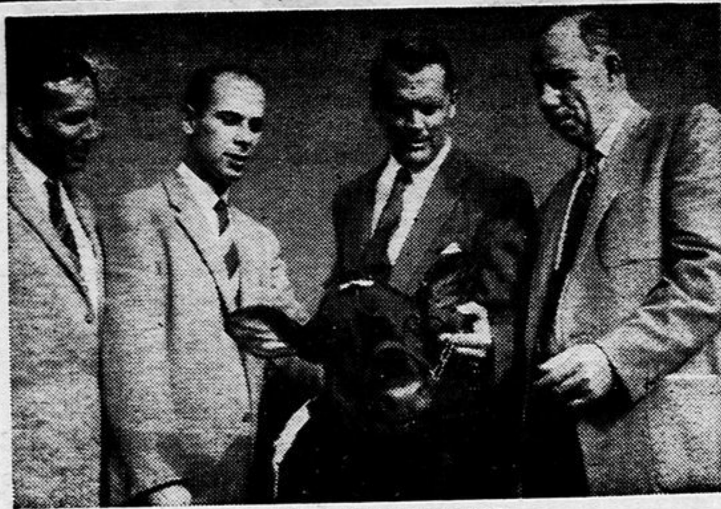
CBC'S FARM TEAM