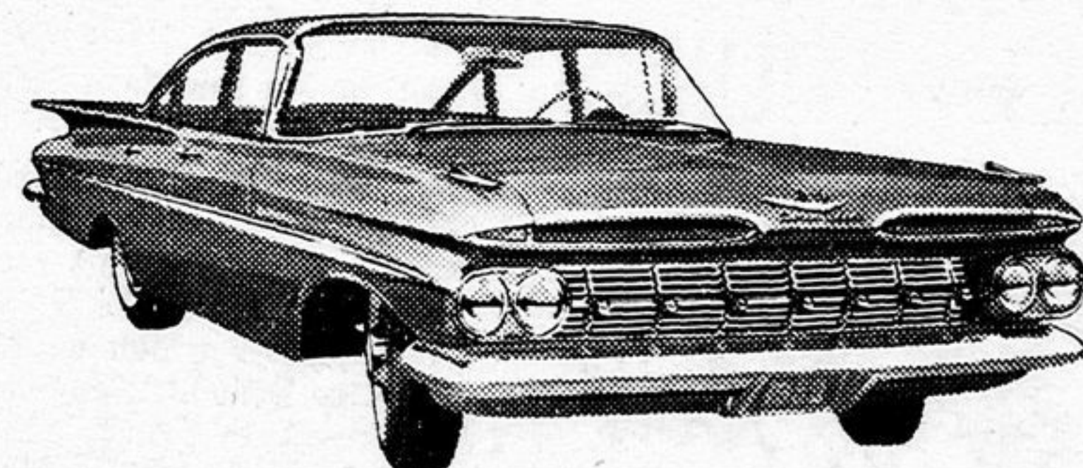
Bel Air 4-Door Sedan — new right down to its tires.

There's still more! A new Magic-Mirror finish that keeps its shine without waxing or polishing for up to three years. New Impala models. Wonderful new station wagons — including one with a rear-facing rear seat. And, with all that's new, you find those fine Chevrolet virtues of economy and practicality. Stop in now and see the '59 Chevrolet. *Extra-cost option.