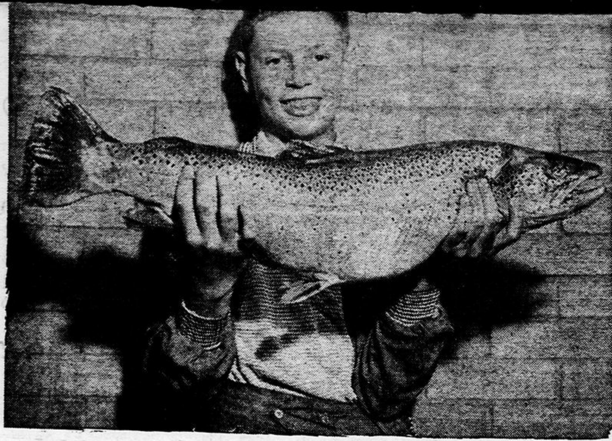
SEEING IS BELIEVING

Correspondence was received from the Department of Labour, re Trench Excavators Protection Act. Community Planning Association advising of convention. Dept. of Municipal Affairs advising a change in 1957 tax bills. Dept. of Agriculture enclosing new Dog Tax Act, the Cattle, Sheep and Poultry Protection Act. Dept. of Agriculture enclosing cheque for $191.39 representing provincial grant under the War-