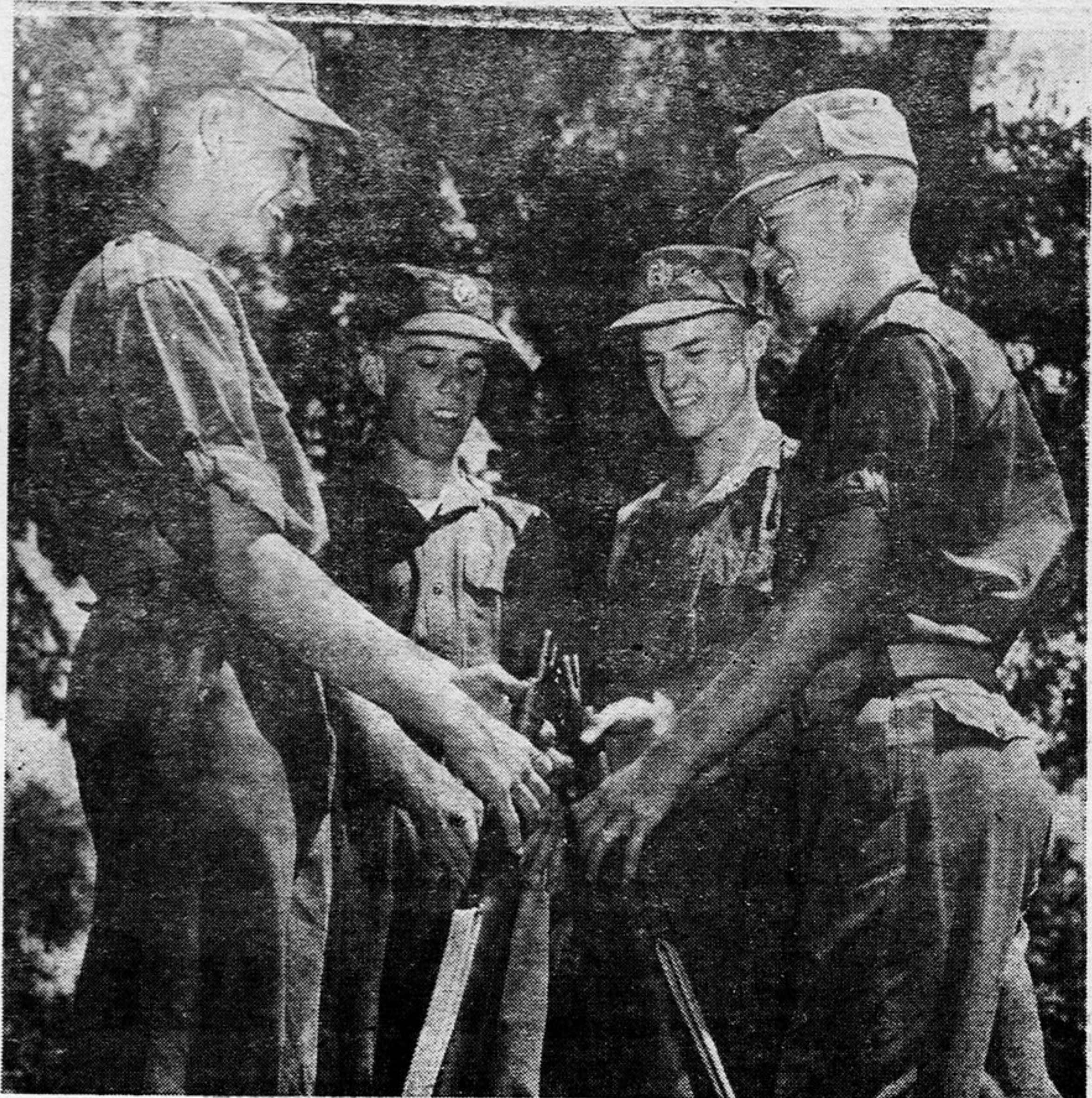
Summer Recruits From The Hasty P's Stack Rifles During Training at Niagara Camp.