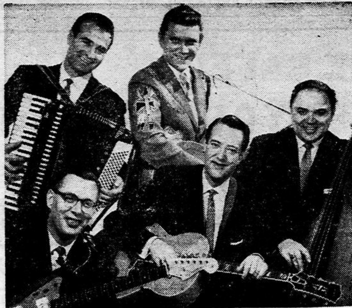
THE TOMMY HUNTER SHOW