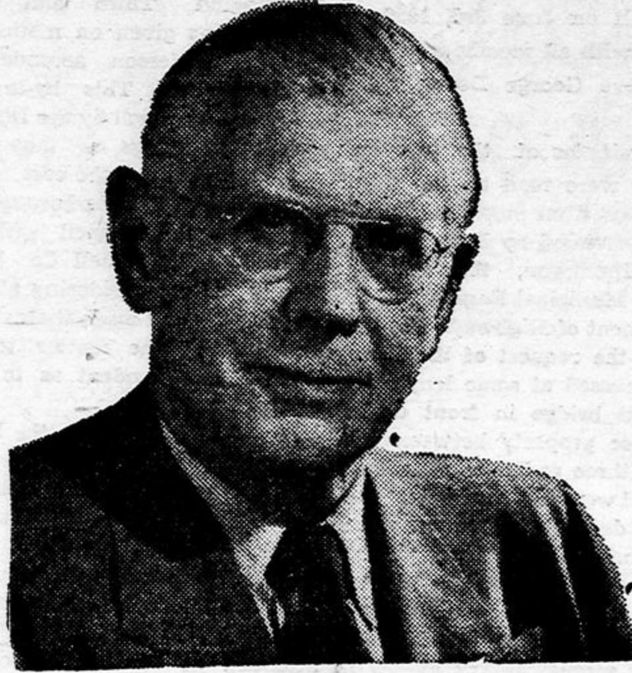
PREMIER LESLIE FROST, of Lindsay

January 1958 your Council saw danger of a possible outbreak of typhoid or possibly something more serious, due to fact that your water supply ran through a deteriorated pipe line for a length of five hundred feet covered completely over the full length with weeping beds, fed by Cess Pools, and Septic Tanks turning this section into a contaminated area, instructions were given to the Millbrook Public Utilities Commission to take steps to correct this condition, this was put into operation, a sanitary engineer was engaged to make a report, prepare drawings and other documents required by all government authorities, including Health