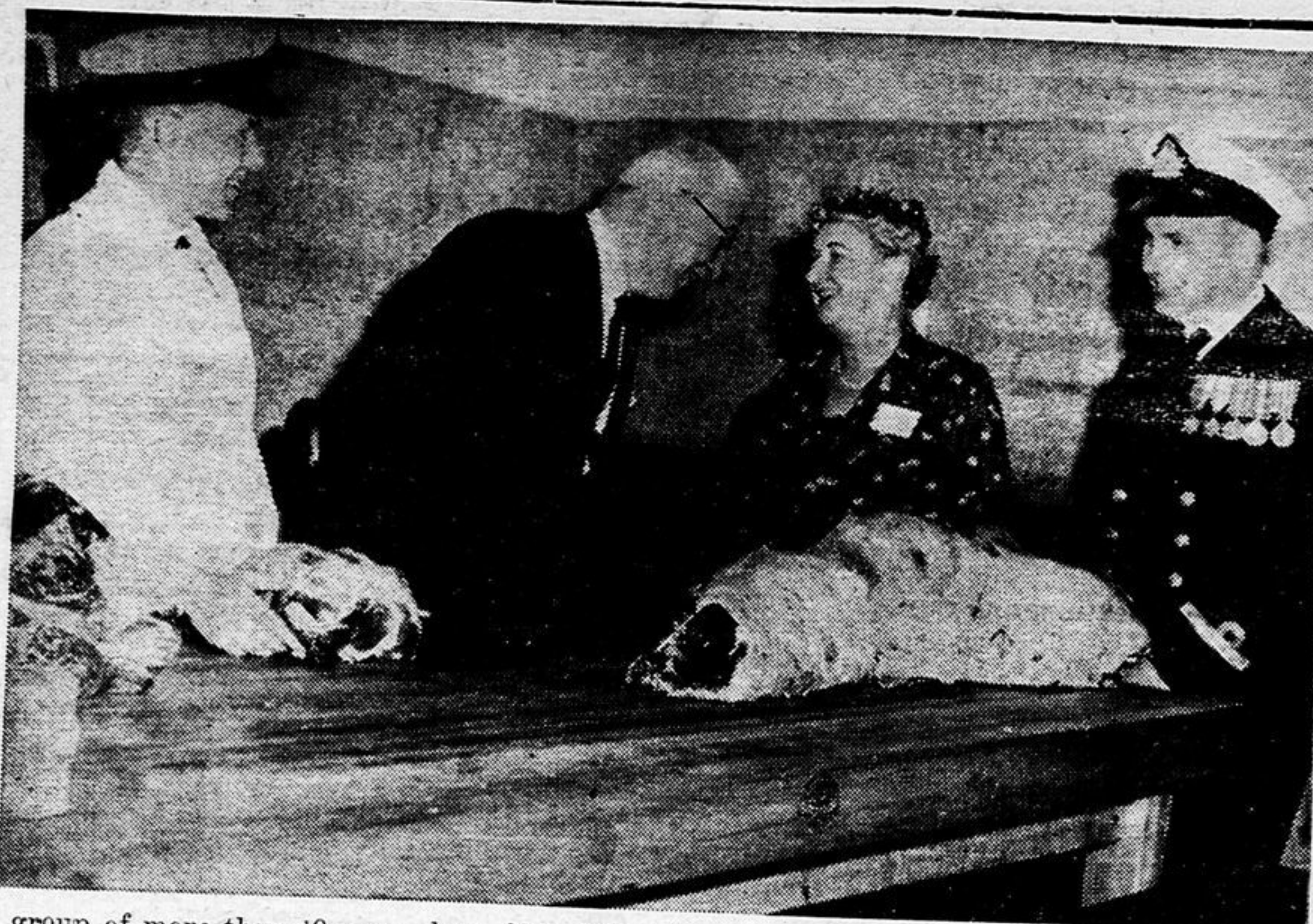
A group of more than 40 members of the Senate and House of Commons recently visited units of the Royal Canadian Navy at Montreal as guests of the Hon. G. R. Pearkes, V.C., Minister of National Defence. Units included HMCS Hochelaga, Mr. Pearkes

S. S. Kresge Co. Limited, believe in the community it serves. Its staff of salespeople are recruited from the territory it serves. We recommend this store to you as worthy of your consideration. They are happy to serve you.