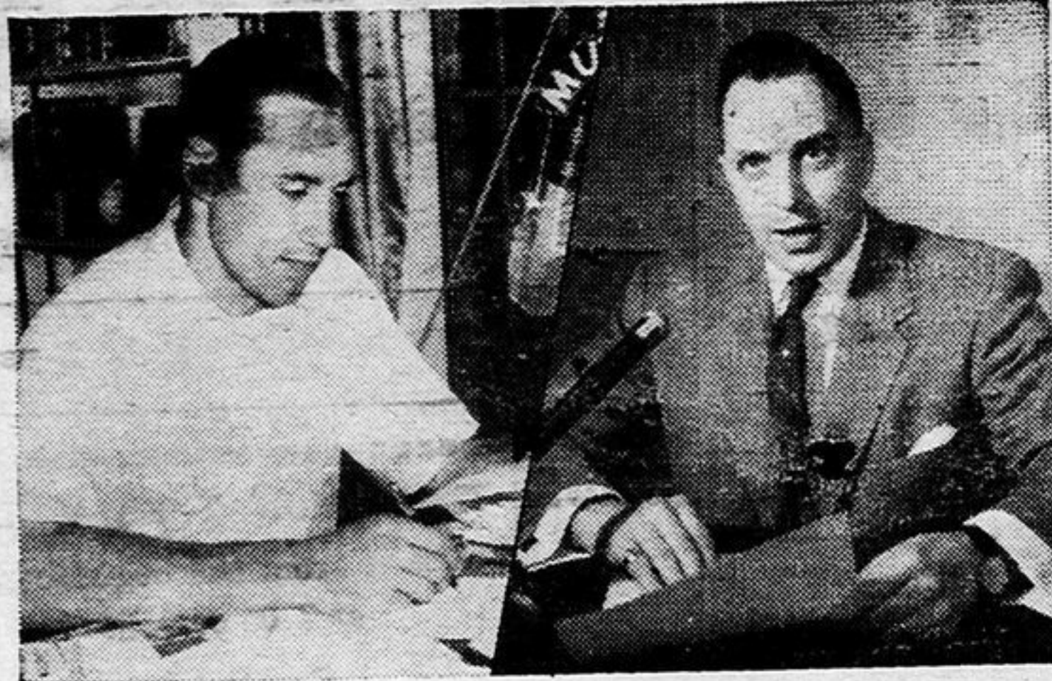
GAME OF THE DAY

You have been provided the capacity and ability to use your faith in any way you chose, for you are a free moral agent. You are able to fix your attention upon God, focus-