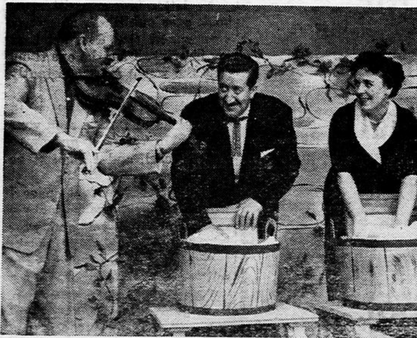
WASH THE BLUES AWAY