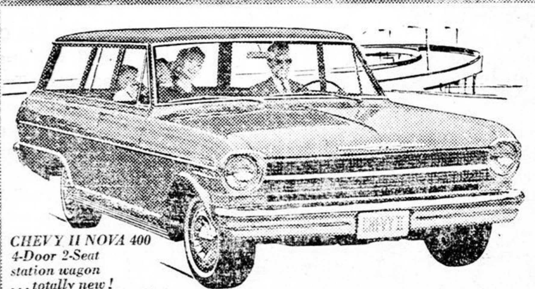
CHEVY II NOVA 400 4-Door 2-Seat station wagon ...totally new!

This is the car with the cats-paw traction — the one that corners on a dime, that leaps through the rough, tough going. But that's not all! There's style, comfort, dependability, economy — and a feeling of driving something special!