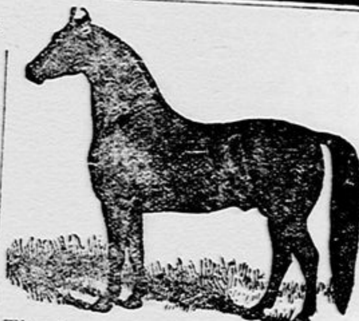
The Imported Hackney Stallion, "Terlington Bellerophon"