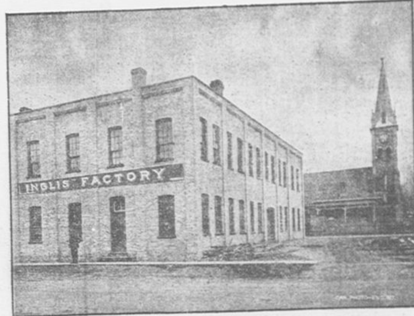
INGLE'S PLANING FACTORY.