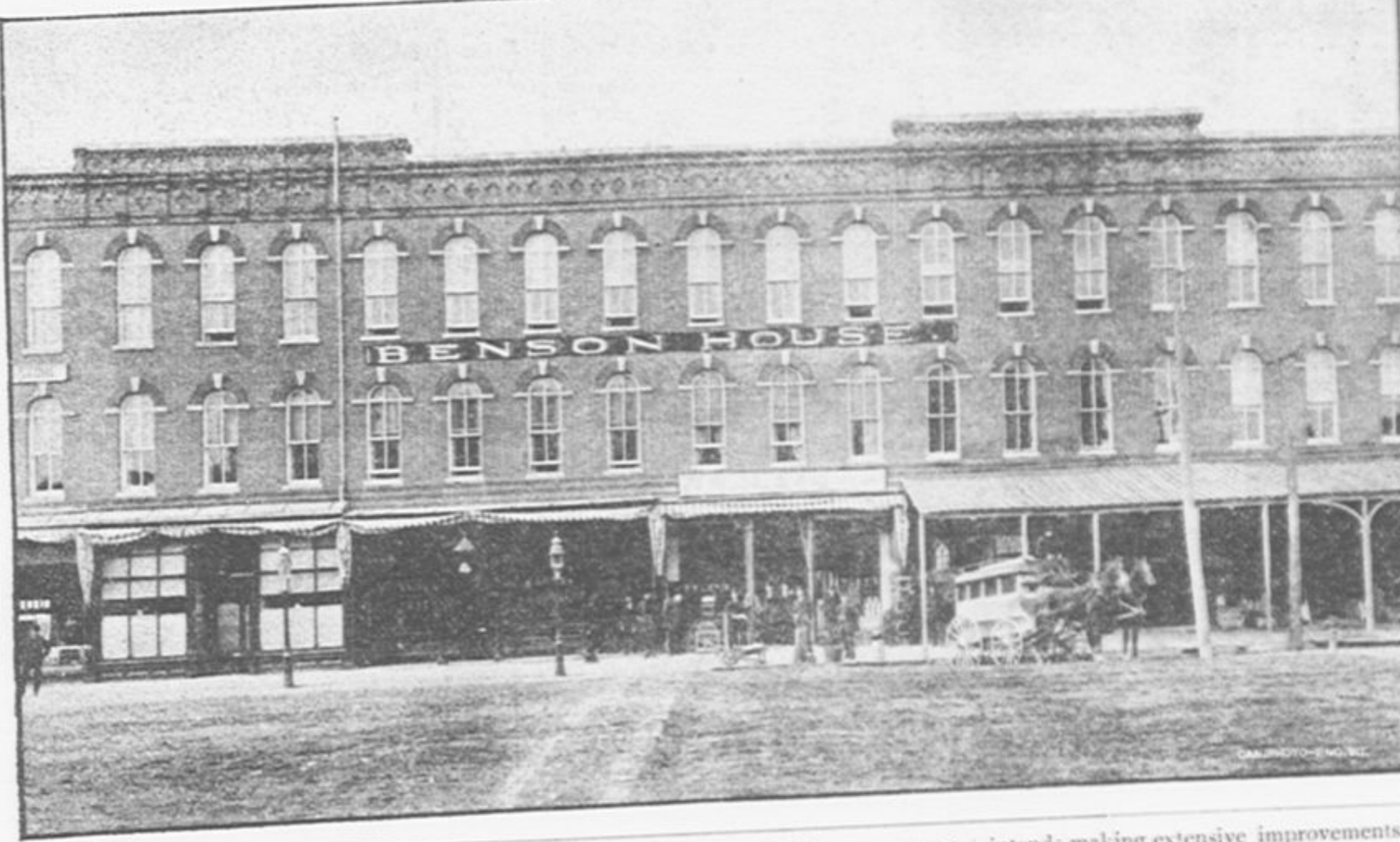
THE BENSON HOUSE.