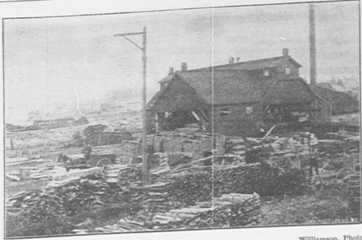
LINDSAY LUMBER MILL.