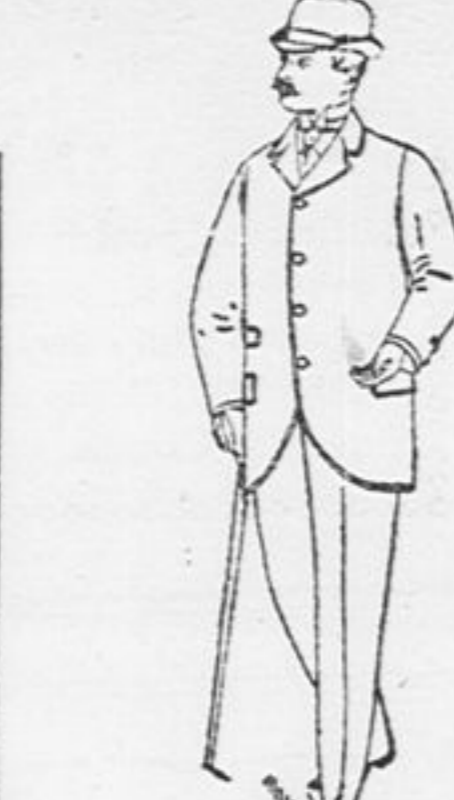
This Suit in well-washed Tweed goods, $8, $7.50 and $10.