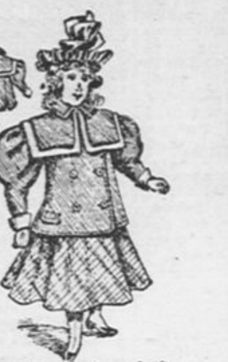
This Overcoat in all the popular Cloths, Velvet C. Lin., $7.50 to $10.00.