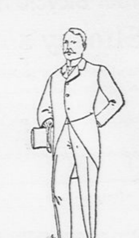
This Suit in Black Worsted, $10.00, $12 and $15.00.