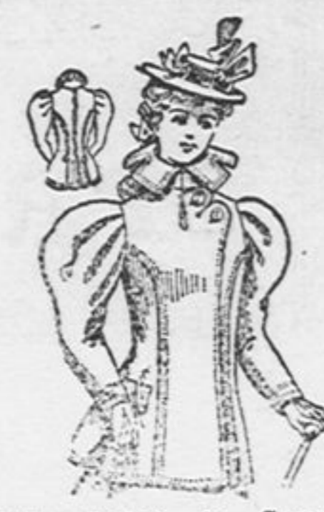
This Jacket, in Covert Cloths, Carls, Beavers, $4.50 to $15.00.