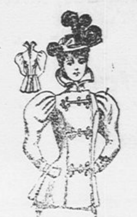
This Jacket, Colored and Blk., different Cloths, $4.50, $7.50.