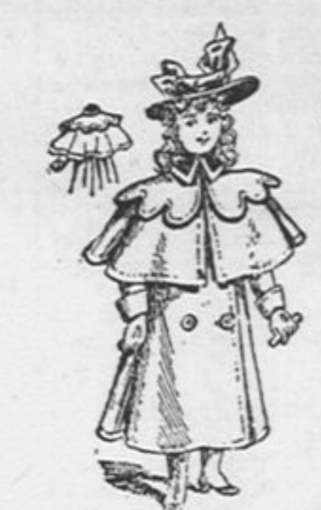
Children's Ulsters made in all the popular cloths. Prices vary from $2.50 to $8.00.