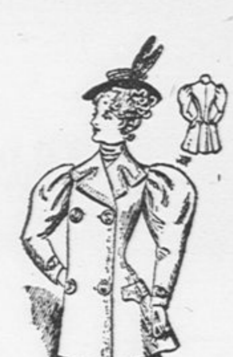
This Jacket, Coat and Beaver Cloth, $3.50, $5.

you the various lines of Goods in all departments that we carry. Being the only people who go from Lindsay to the great markets of the world to buy we have the Best Values in this part. We are showing the very Best Values that can be given for little money.