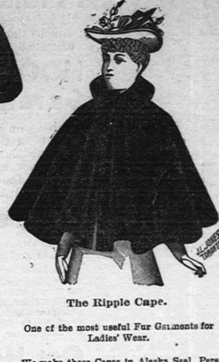
The Ripple Cape. We make these Capes in Alaska Seal, Persian Lamb, Sable, Otter, Mink, Raccoon, Grey Lamb and Greenland Seal.

These goods are all our own stock. We have a special line of Musk-Ox Robes, Bear and Matass-ma. All the prices mentioned in last week's POST will rule for the next week. Don't Miss this Great Clearing Sale of Furs.