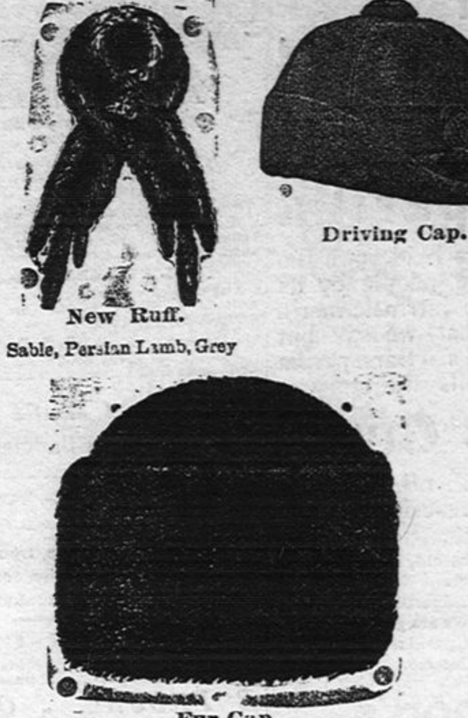
Driving Cap. One of the most useful Fur Garments for Ladies' Wear.