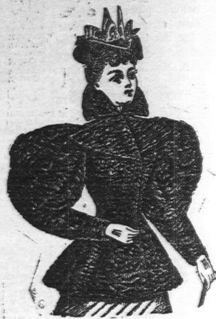
Grey Lamb Jacket. Also in Astrachan and Persian. Special Value.

These goods are all our own stock. We have a special line of Musk-Ox Robes, Bear and Matass-ma. All the prices mentioned in last week's POST will rule for the next week. Don't Miss this Great Clearing Sale of Furs.