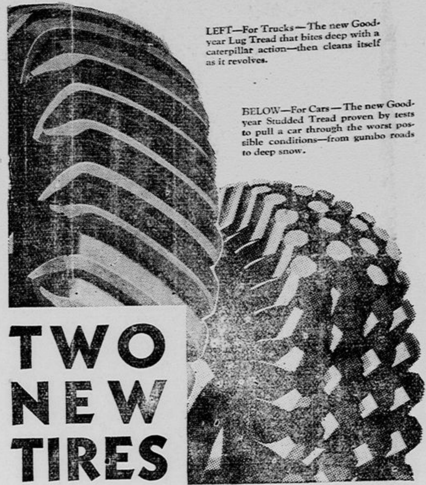
LEFT—For Trucks—The new Goodyear Lug Tread that bites deep with a caterpillar action—then cleans itself as it revolves.

But as I said before the trouble all started when our juniors called the colts went to Lindsay and defeated the Lindsay juniors 6-4, it his game sort-of went to the boys heads and they immediately decided that they toos hould enter into the Junior O.H. A., because they defeated the Lindsay entry, for the Ontario Hockey Association, and they thought that when they were good enough to enter the O. H. A. Defeating the Lindsay team wouldn't put any feather in any teams hat, as Lindsay hasn't anything to be proud of as a Junior team and the locals, we will say have got a little more than Lindsay, and are good enough to enter into Junior Hockey and that is all, they wouldn't draw a crowd and they wouldn't get in the playoffs, unless something like a miracle happened. Still the lads are a little young and much too light as a team but their is a couple that are just dandy and would make a good team with another years weight added upon their bones, and a little