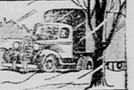
In snow the Goodyear Lug Tire avoids delays, protects loads, allows faster, safer speeds.