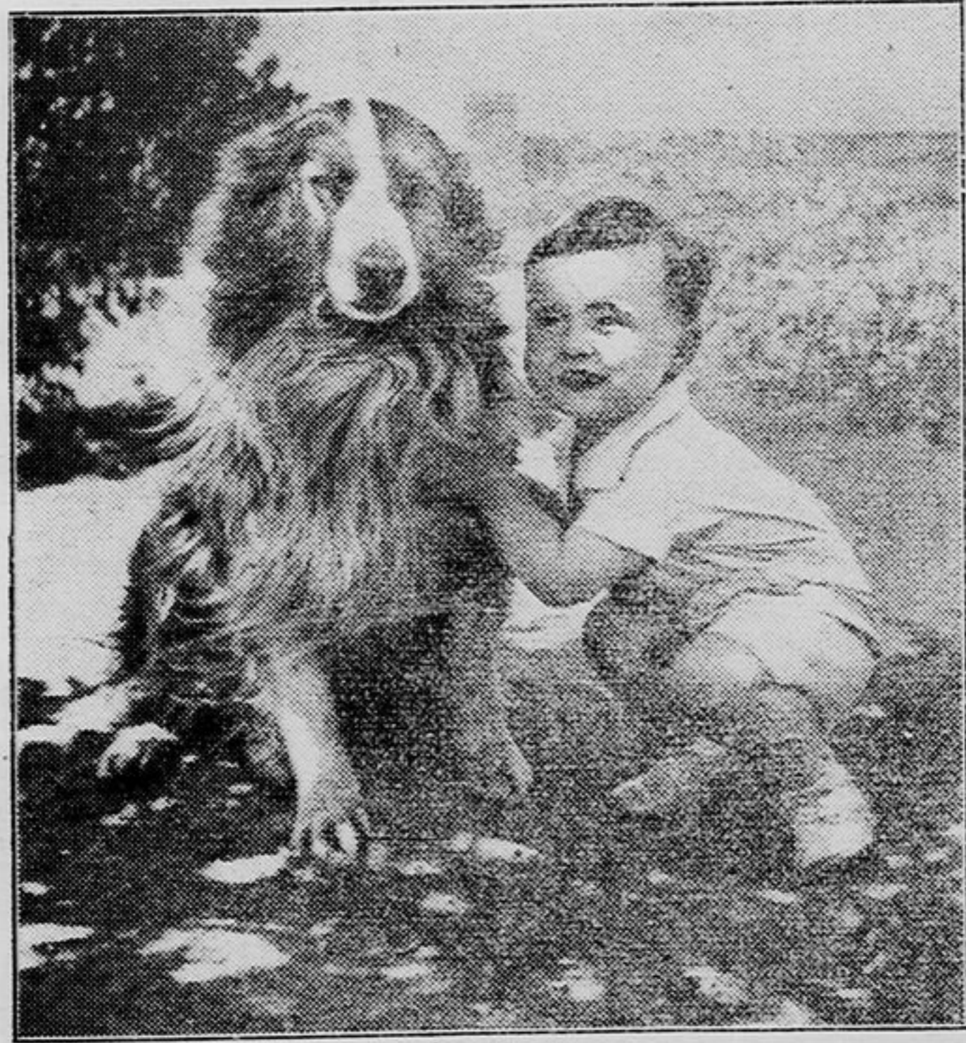
Pictures like this you don't want to lose. The place for them is in an album.

Good Photographs Are Worth Taking Care Of