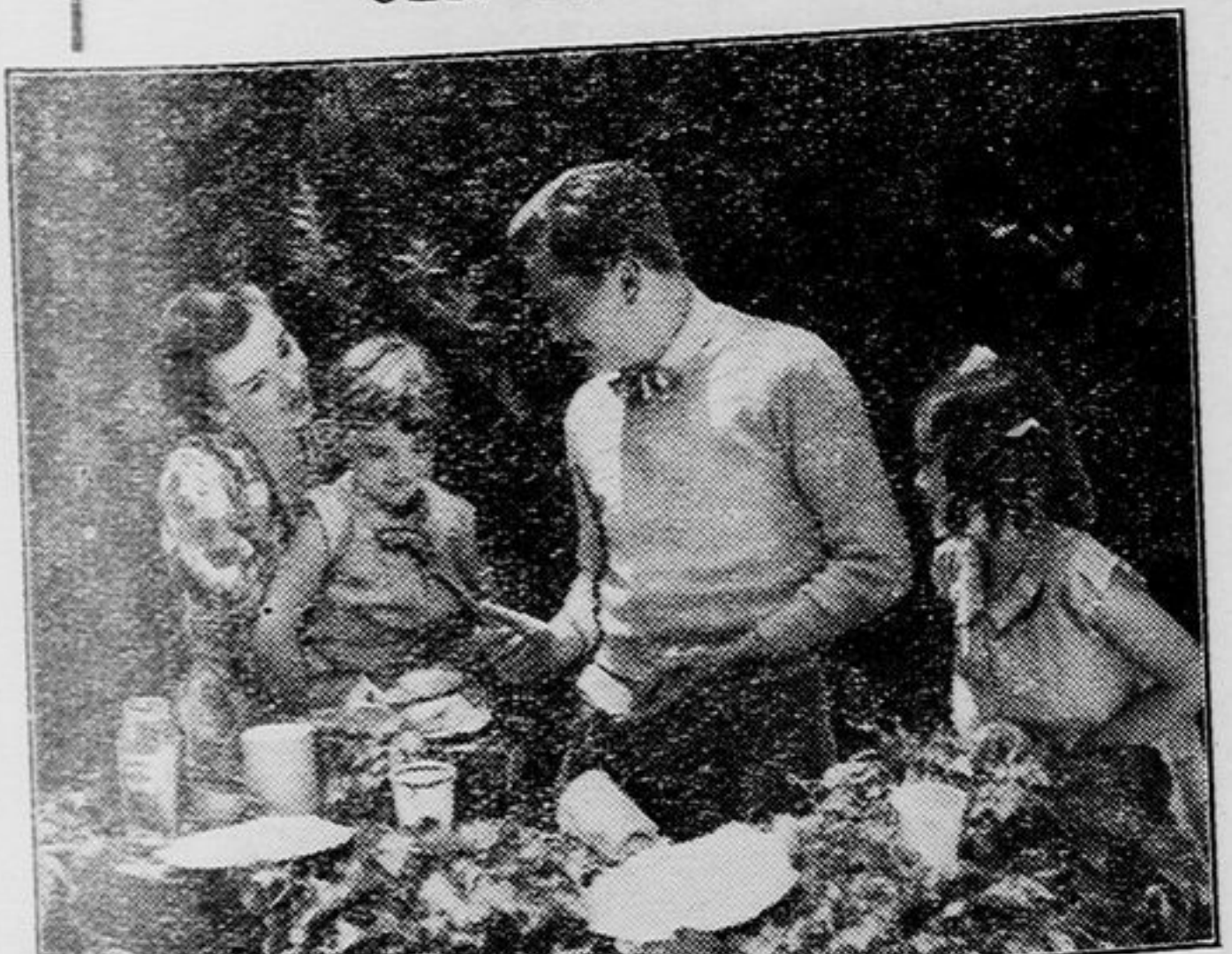
You can take a picture of the family picnic and be in it yourself by using a self timer.

THE question is often asked, "Is there any way that I can take a snapshot of my friends and include myself in the picture?" There certainly is a way and a simple one. Use a self timer.